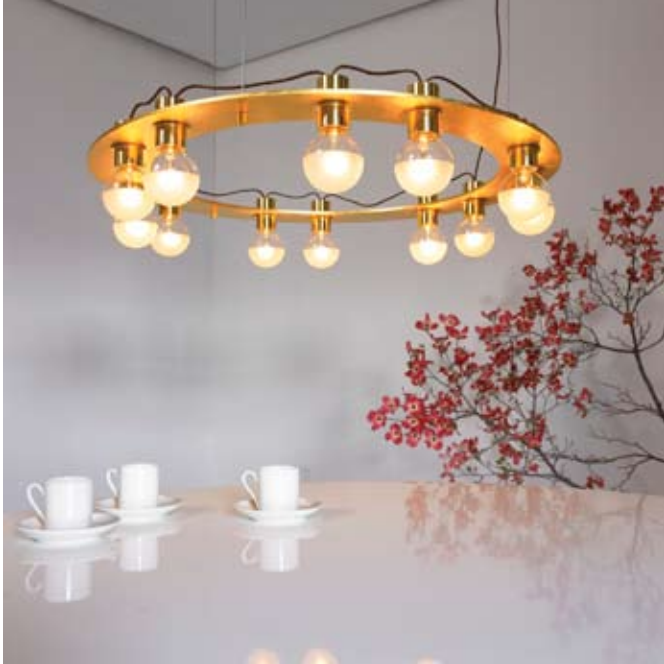
FLOAT Halo Large shown in 24K gold leaf and gold plated hardware with half etched lamps.