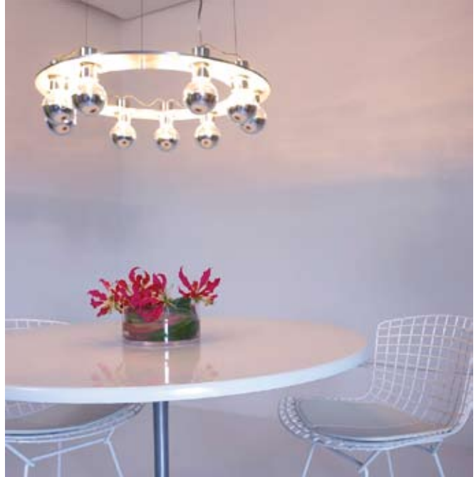
FLOAT Halo Small shown in satin aluminum with polished aluminum hardware.